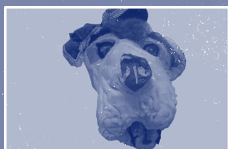
Underdog - guitar/drum