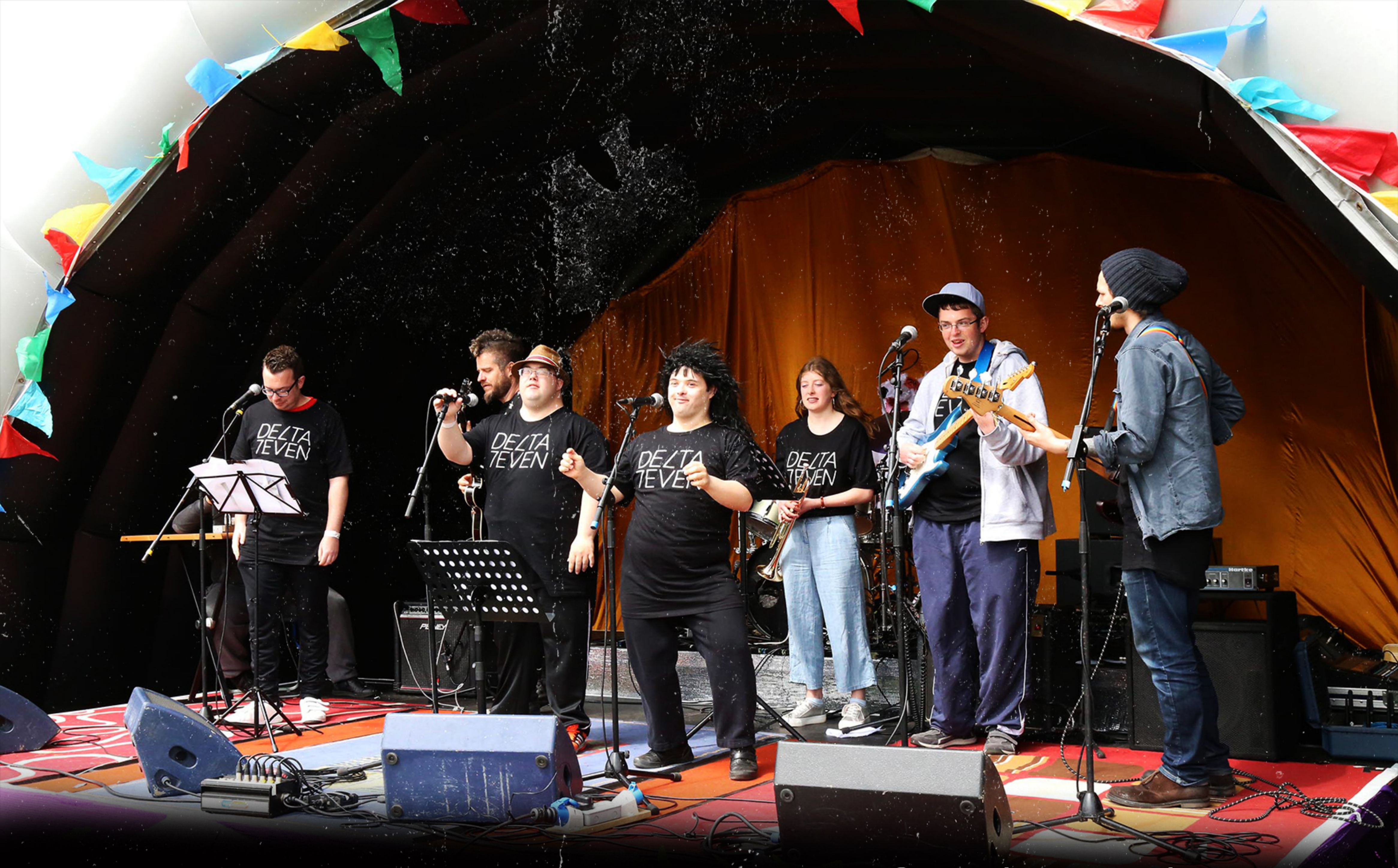
Every Sort of People Festival Lewes

Some people like swimming Some people like singing Some people like the cinema Some people like cooking Some people like Eastenders Some people like Hollyoaks Some people like Emmerdale Some people like Jazz